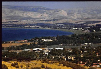
Sea of Galilee