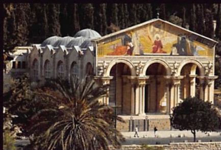
Church of all Nations

Note: Tour operator reserves the right to alter this itinerary.