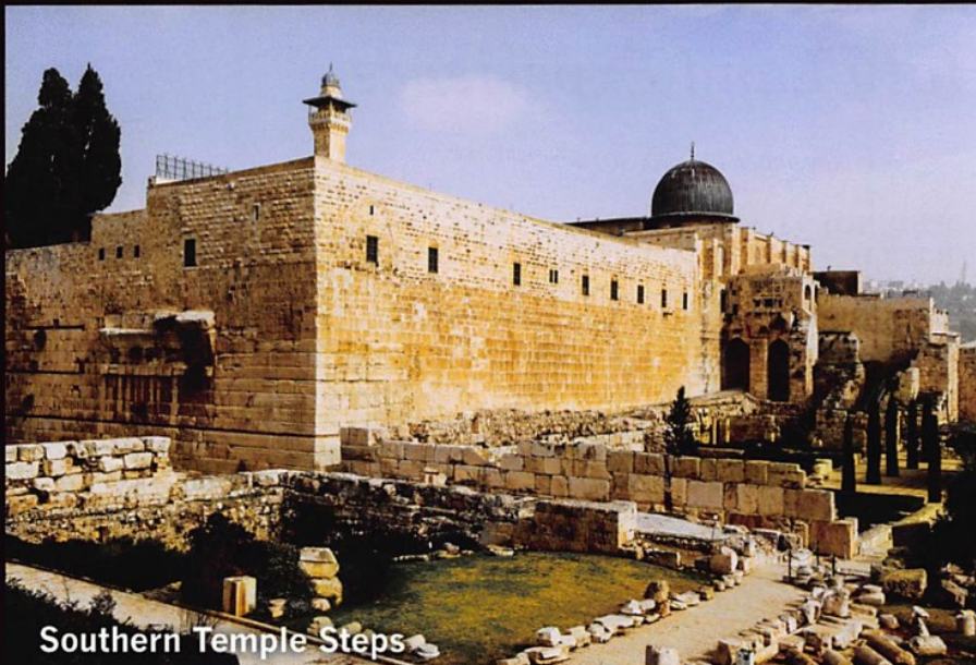
Southern Temple Steps

Scheduled International Flights • Top Quality Four Star Hotels • Israeli Buffet Breakfast & Dinner Daily • Top Guide with In-Depth Knowledge of the Old and New Testaments • Private Air Conditioned Motorcoach Visits to the Major Historical Sites • Boat Ride on the Sea of Galilee • Certificate of Your Pilgrimage to ISRAEL ..... .....and more!