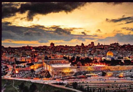
Sunset over Jerusalem